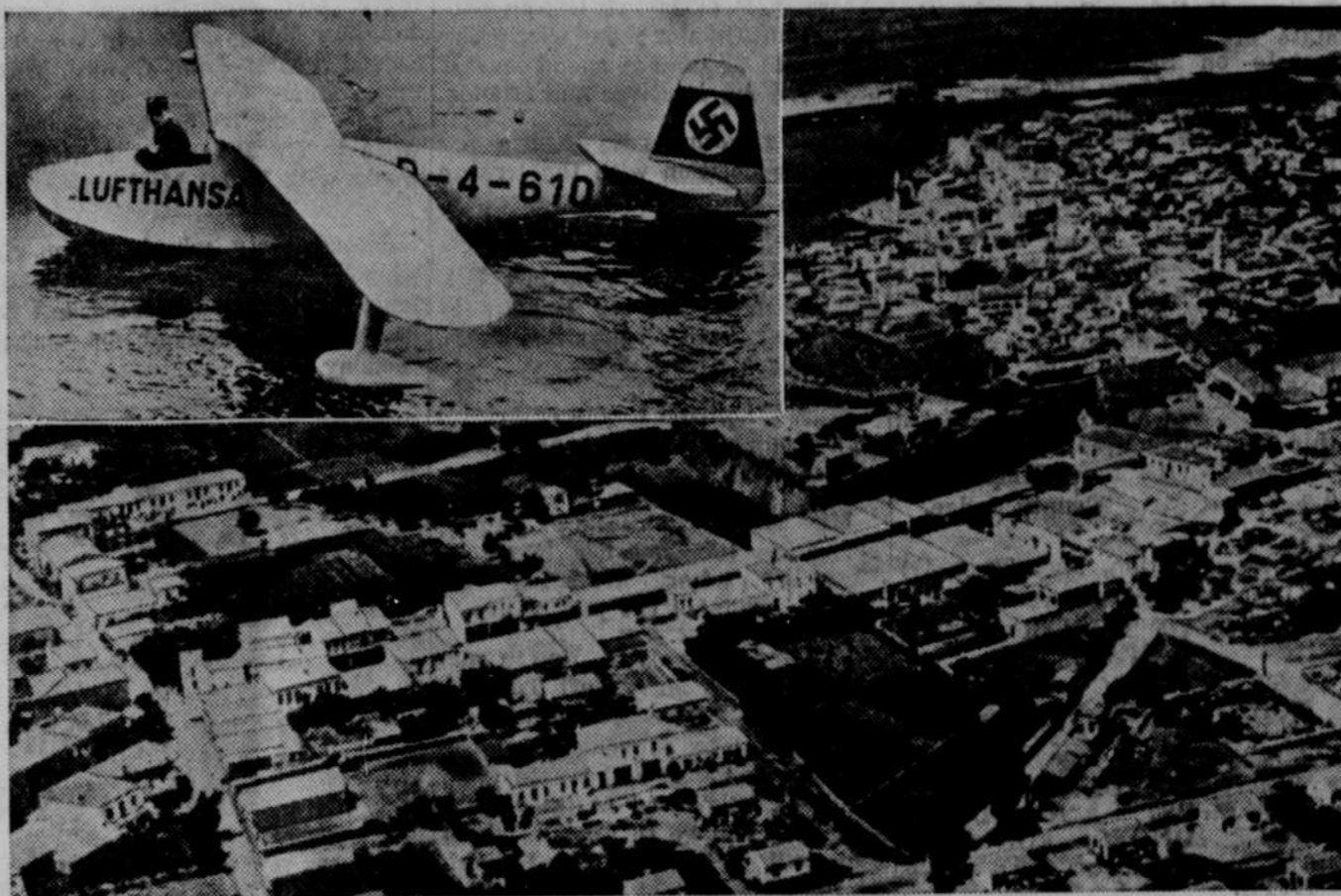
In the Nazi invasion of the Greek island of Crete the Nazis used gliders as troop carriers for the first time, although they have experimented with them long before the current war. Above is shown Canea, capital of Crete, defended by Greek-British forces, which was one of the principal objectives of Nazi attack. A Nazi amphibian glider troop carrier of the type used is shown in inset.