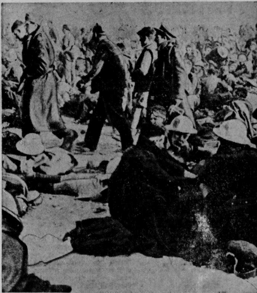
This picture, taken somewhere in Africa, shows a group of British soldiers fresh from the fighting lines of the see-saw battle of the dark continent. They are shown in the prison camp to which they were removed after they were captured by the successful Nazi and Italian forces campaigning in Africa.