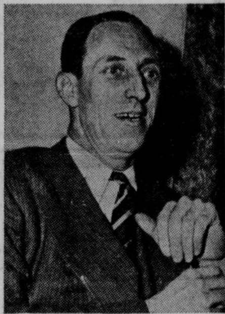
Harry Bridges, shown as he took the stand in his own defense, in San Francisco, to escape deportation on charges of alleged communistic affiliations.