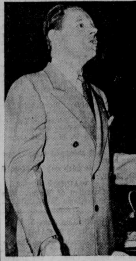
Assistant Secretary of Treasury John L. Sullivan, appearing before house ways and means committee on the new $3,500,000,000 tax program, urged drastic revision of the excess profits tax levied last year, in an effort to drain off arms profits.