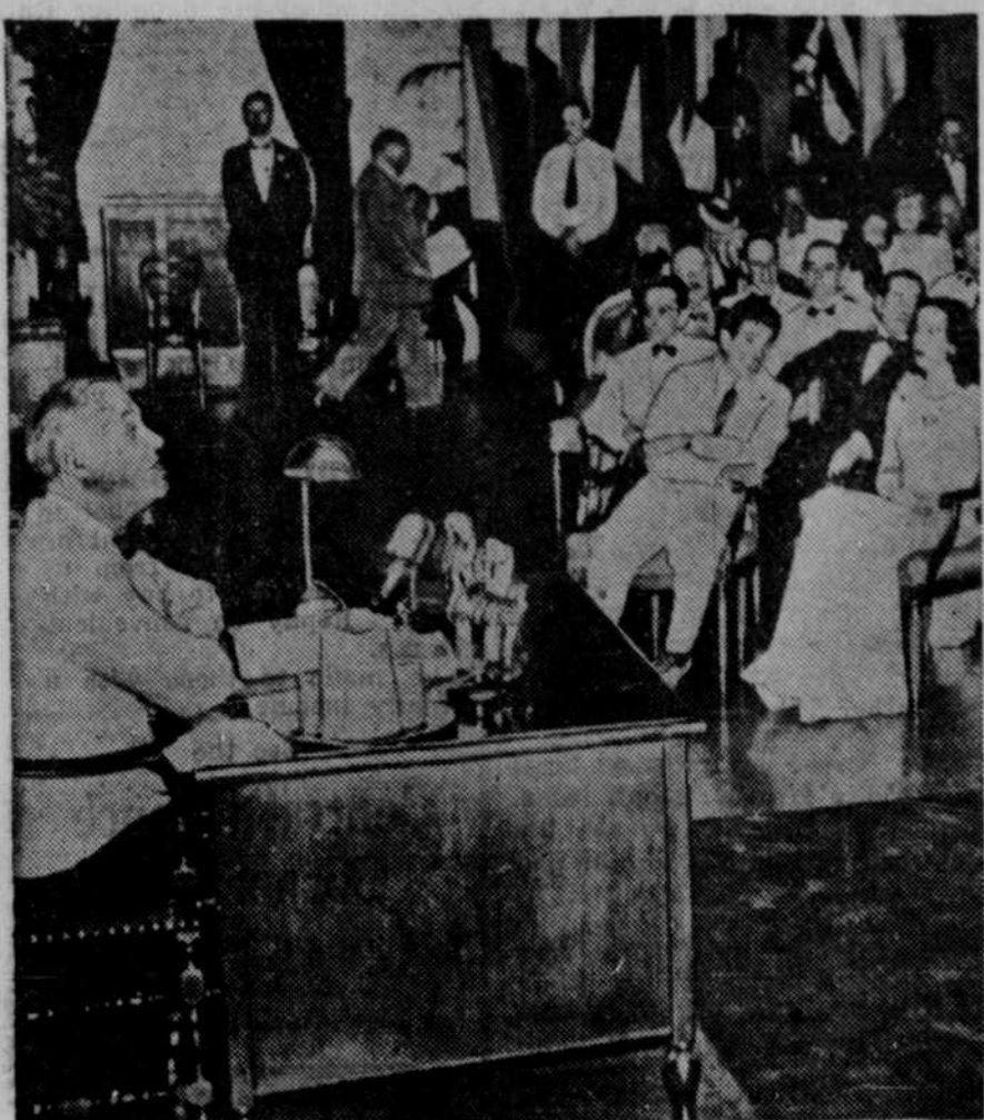
Soundphoto showing President Roosevelt as he delivered his momentous "fireside chat" to the nation from the East room of the White House. He declared the existence of "an unlimited national emergency." His listeners in the White House were cabinet members, diplomats of the Americas and other democracies and their families.