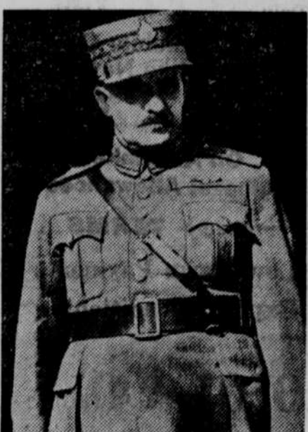
General Tsolakoglu, who signed the Greek surrender at Salonika, and who is reported to have formed a new government, rival to that of King George II at Crete.