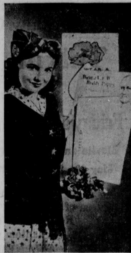
Daughter of a World War veteran, Joan Leslie, actress, is shown in her new role of national "buddy" poppy girl. She was selected for the 1941 "buddy" poppy campaign of the Veterans of Foreign Wars of the U. S., for aid of veterans' families.