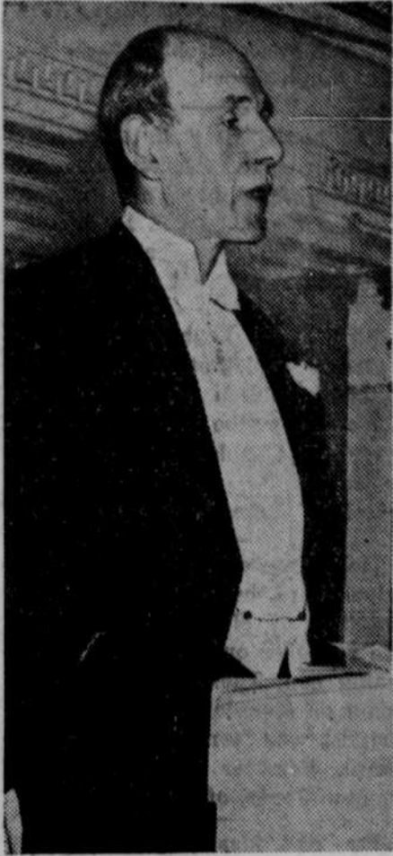
Lord Halifax, British ambassador to the U. S., shown as he delivered his speech in behalf of American aid to Britain, in Chicago. He declared "war's end must bring a system by which all men will find opportunity to build the foundations of a good and decent life."