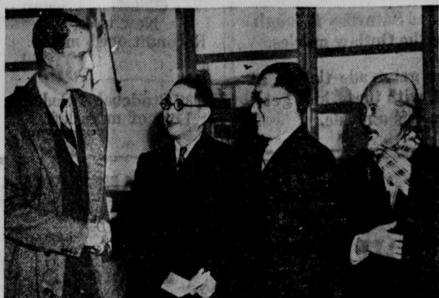
Appointed foreign minister of China while serving as that nation's ambassador in London, Dr. Quo Tai-Chi is shown on arrival in New York. L. to R., Newbold Morris, president New York city council, welcoming Dr. Quo Tai-Chi, while Dr. Hu Shih, Chinese ambassador, and Li Yu Ying (right) personal representative of Chiang Kai-shek, look on.