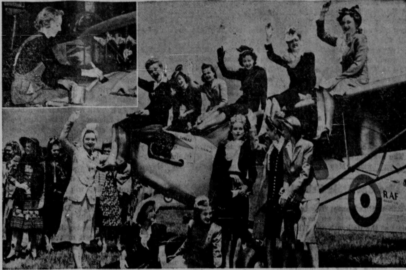
The largest fleet of light planes ever seen in New York was christened on behalf of the R.A.F. benevolent fund, and will make a barnstorming tour of the country to raise funds for the families of England's air defenders. The fleet was inspected by these models. Inset: A Canadian woman working in a De Havilland aircraft factory at Ottawa, Canada. In Canada, women are taking the place of men in industry.