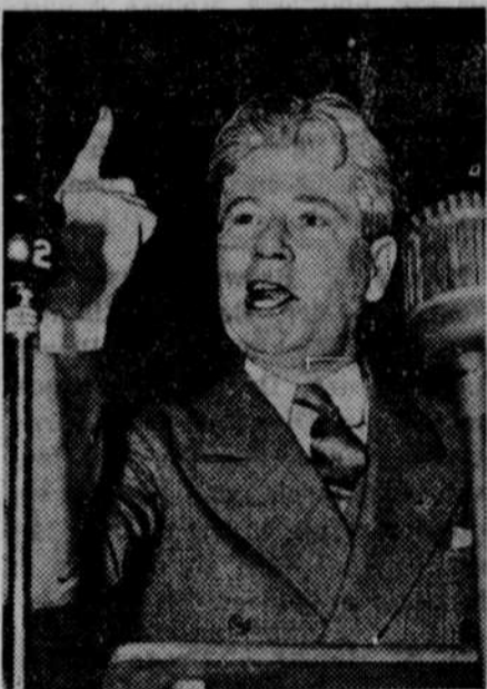
Former Gov. Philip LaFollette of Wisconsin, as he delivered a fiery anti-war speech in Hinsdale, Ill. He urged that America remain at peace.