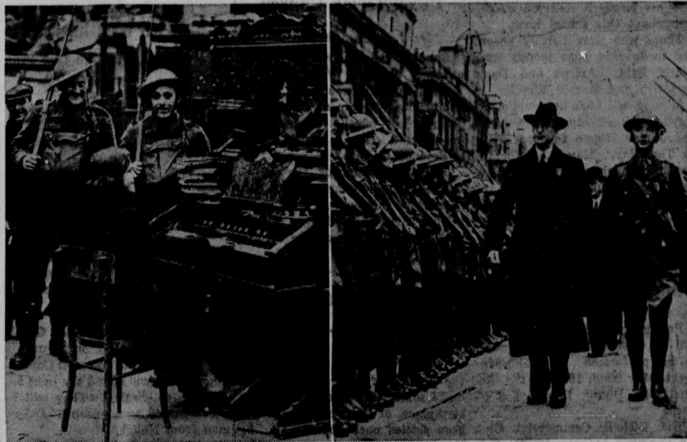
Northern Ireland has had a taste of Nazi wrath, and southern Ireland is getting ready to meet "any invader." At the left an impromptu concert is enjoyed in a destroyed area of Belfast after German bombers visited Northern Ireland. At least 500 lives were lost. Right: Prime Minister Eamon De Valera of Eire inspects troops during the greatest military display ever seen in Dublin.