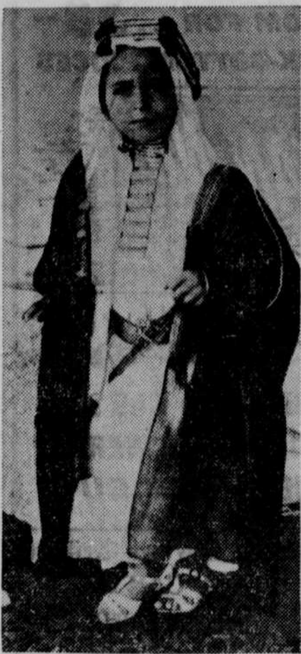
Faisal II, king of Iraq, who celebrated his sixth birthday while the artillery of his army was shelling British troops who had taken refuge in the R.A.F. base at Habhaniyah, Iraq. Pro-Nazi Rashid Beg Gallani is in the saddle as premier of Iraq.