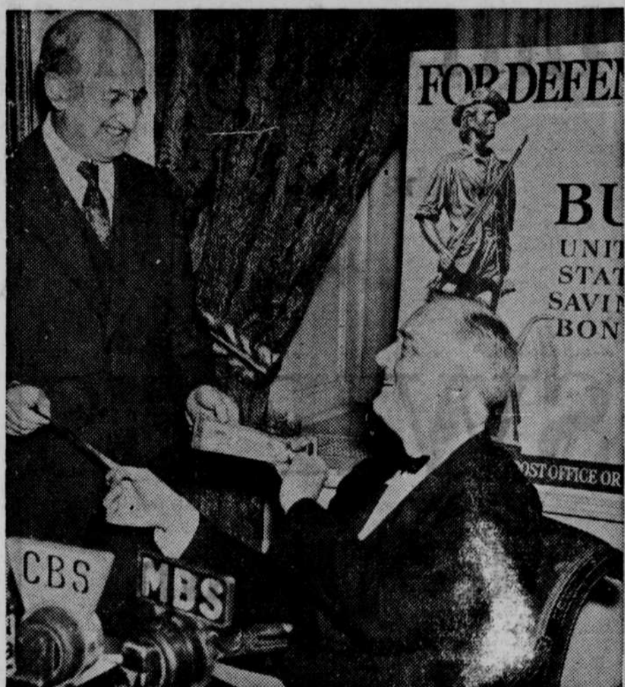
President Roosevelt is shown as he purchased the first defense savings bond and officially opened the treasury's multi-million dollar defense savings campaign. The new savings stamps and bonds are on sale at post offices and banks and range from 10 cents to $10,000 in denomination. Secretary of Treasury Morgenthau is shown handing the President his bond just before the nation-wide radio addresses.