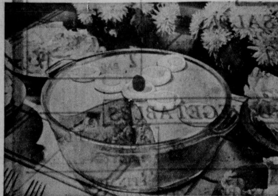
PUDDING FAVORITE AS MEAL TOPPER-OFFER (See Recipes Below)