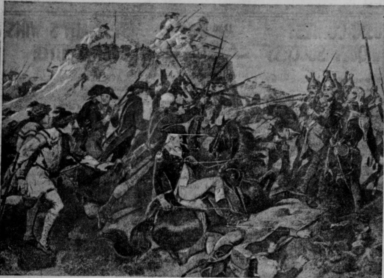
HIGH TIDE IN THE CAREER OF A MILITARY GENIUS—Benedict Arnold leads the successful attack on the Hessian redoubt at the Battle of Saratoga, October 7, 1777.