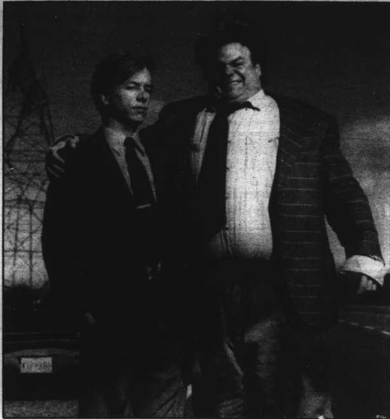
David Spade and Chris Farley star in "Tommy Boy," which opens today.

The latest failure is about Tommy Callahan (Farley), a college graduate after only seven years and a D+ average (you probably know a few of these) who returns to his Sandusky, Ohio,