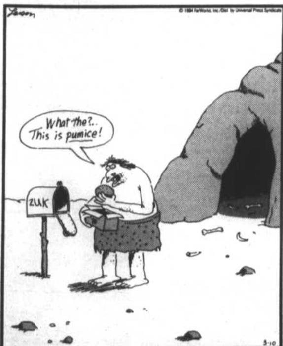
Primitive mail fraud