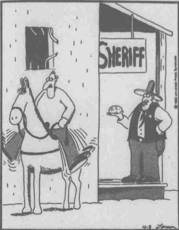
"Hal figured you might try escapin', Bert - so I just took the liberty of removin' your horse's brain."