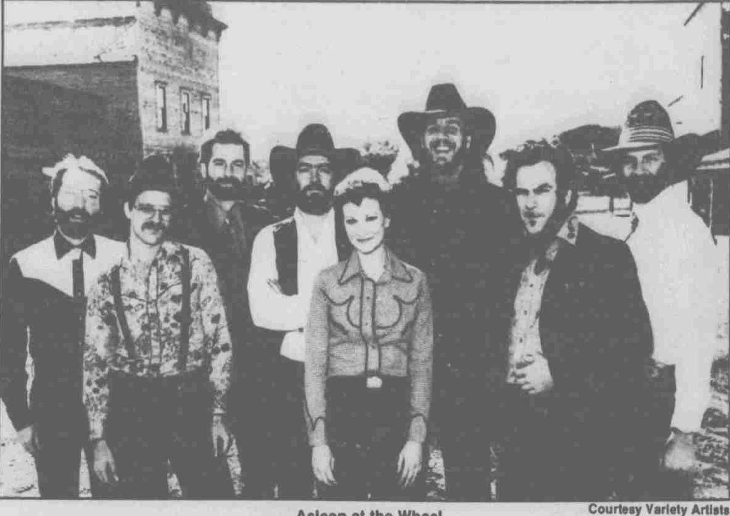
Asleep at the Wheel

Although tonight isn't traditionally a party night, there just may be too much going on out there for anyone to sit at home contemplating TV's John and Yoko story.