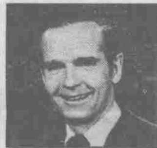
William Proxmire, U.S. Senator

"Reading dynamically is as challenging and stimulating as reading an offense. It is a tremendous technique for gaining understanding on my tight schedule."