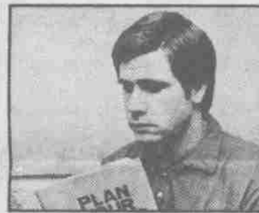
Chris Hanburger, Professional Athlete

"With 60 briefs a week, the average student takes all week to prepare for class. In an evening, I'm finished."