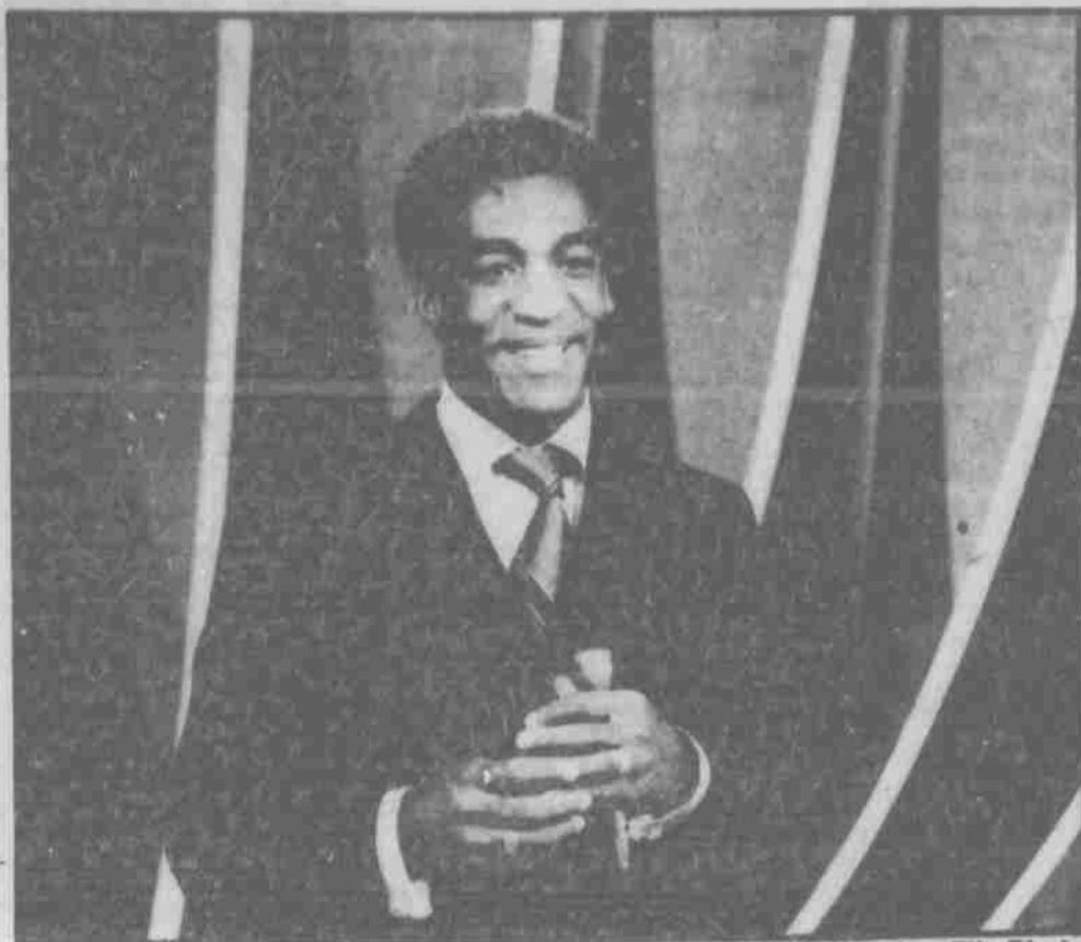
Bill Cosby returns to prime time this fall as a pediatrician on "The Bill Cosby Show."