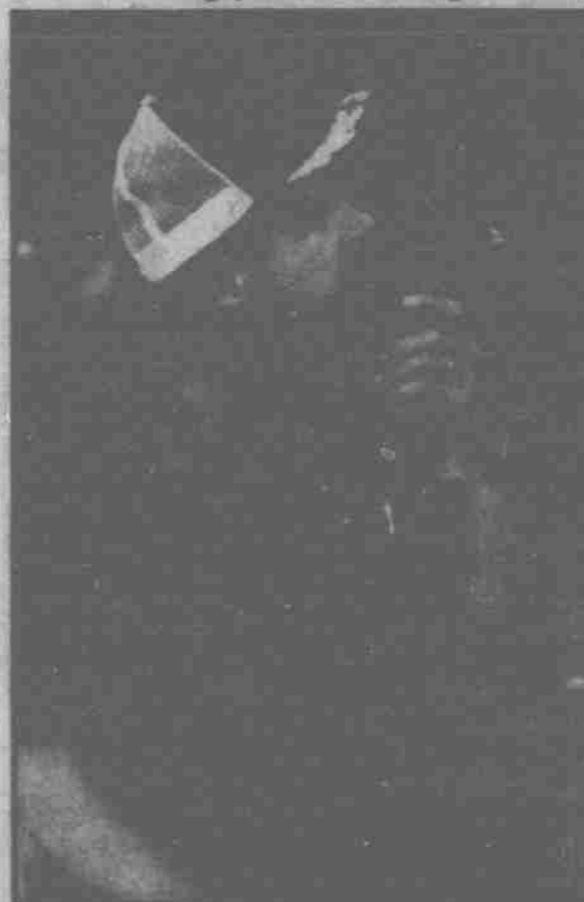
Staff photo by Craig Androsen