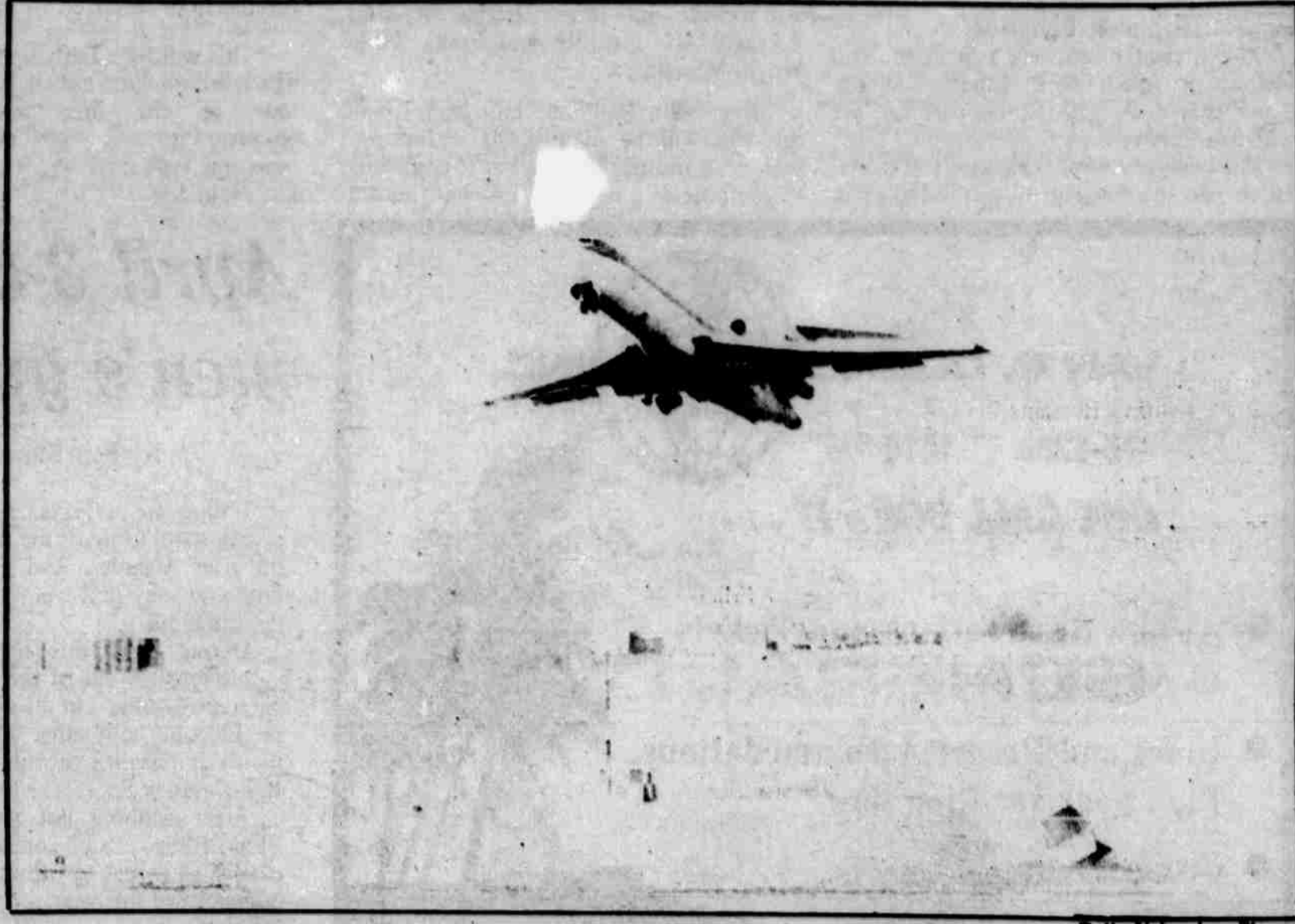
Spring break trips via the friendly skies can be cheaper on most airlines if tickets are purchased in advance and if the purchaser stays more than seven days before returning.

Hitchhiking is illegal on the interstate but it is legal on the ramps leading to the interstate, as long as the pedestrian is not interfering with the normal flow of traffic.