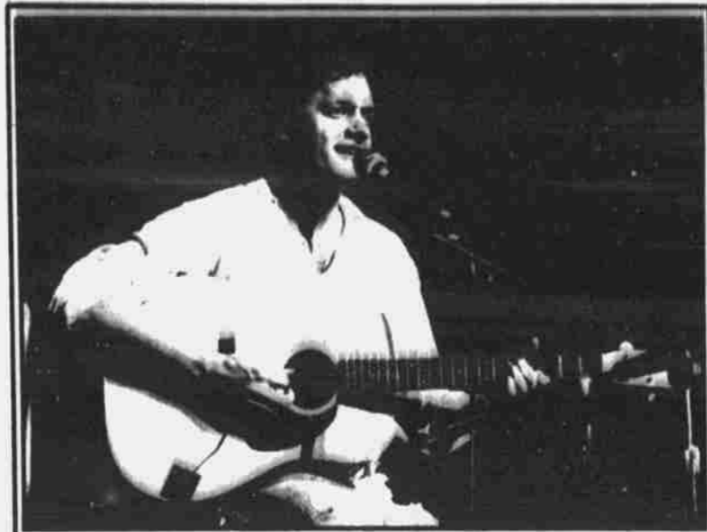
Front Row Productions Presents