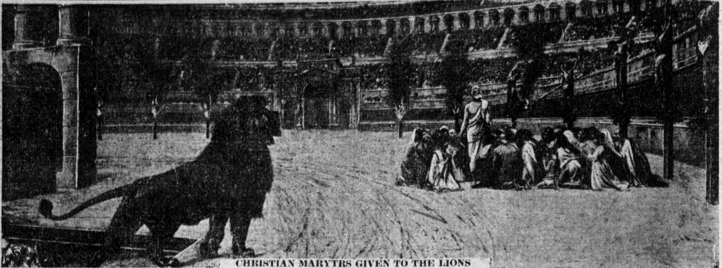
CHRISTIAN MARTYRS GIVEN TO THE LIONS

C HRISTIANITY is the greatest fact in history. The early Christians endured martyrdom rather than forsake Principle. The picture shown herewith, from Ridpath's History, depicts 87,000 people assembled in the Coliseum at Rome to witness the Christians given to the lions. In such a scene may be read the inevitable doom of the Empire that ruled the world. The blood of the Martyrs is the seed from which Christian civilization sprang. If you would know the history of mankind—every sacrifice for principle, every struggle for liberty, every conflict and every achievement, from the dawn of civilization down to the present time—then embrace this splendid opportunity to place in your home the world-famed publication.