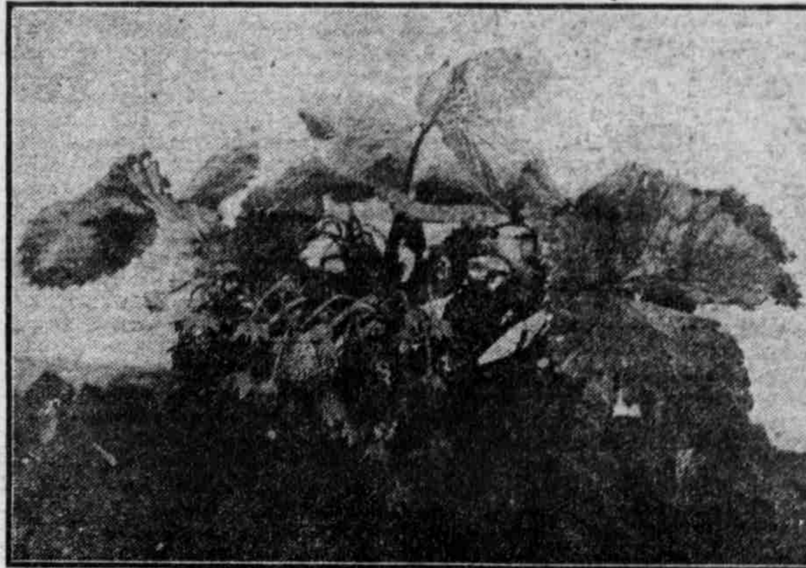
PHOTO OF PLANT WITH BERRIES TAKEN OCT. 6, 1913

Do you want a start of the Famous Everbearing Strawberries? These berries not only produce great crops of fine berries in June, equalling the best June or spring bearing varieties, but you will get big crops of fine, delicious berries during all the fall months. The crop you get in the fall does not in any way affect the crop you get in the following June, so why not plant the fall bearing varieties exclusively as you get all the advantages of the annual varieties and the fall crop extra? Not an experiment. Handled by the best growers. Bear until frost.