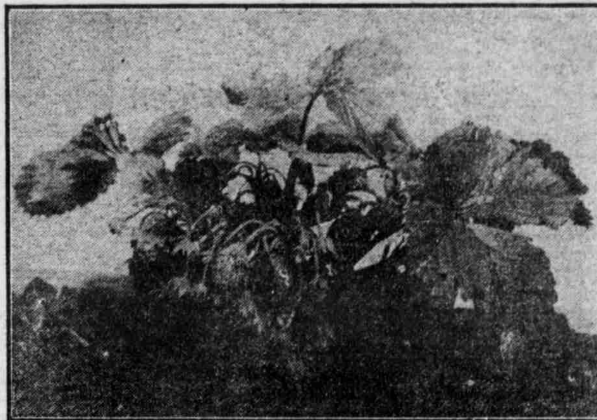
PHOTO OF PLANT WITH BERRIES TAKEN OCT. 6, 1913

Do you want a start of the Famous Everbearing Strawberries? These berries not only produce great crops of fine berries in June, equalling the best June or spring bearing varieties, but you will get big crops of fine, delicious berries during all the fall months. The crop you get in the fall does not in any way affect the crop you get in the following June, so why not plant the fall bearing varieties exclusively as you get all the advantages of the annual varieties and the fall crop extra? Not an experiment. Handled by the best growers. Bear until frost.