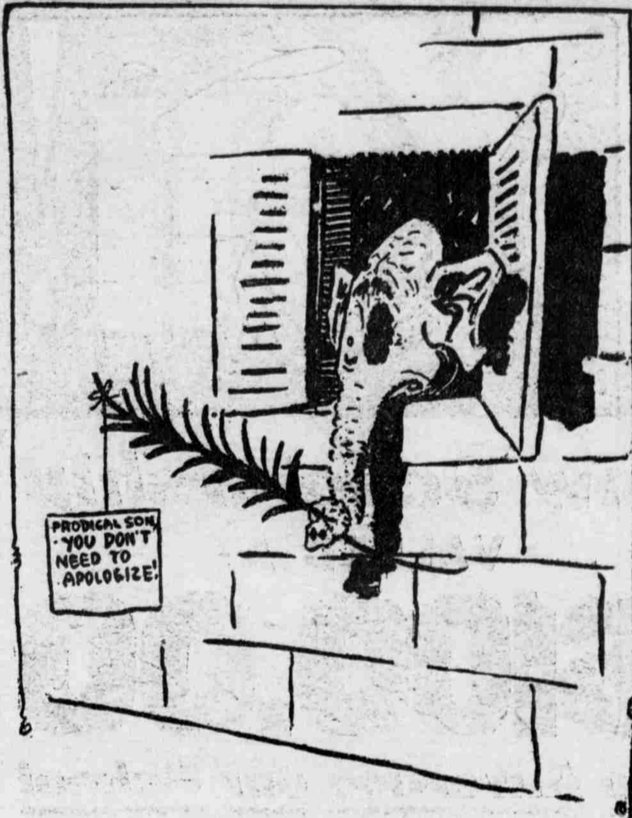
JUST COME HOME TO POPPER. —Ohio State Journal.