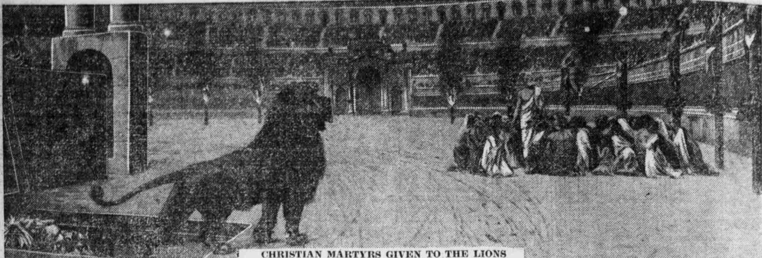
CHRISTIAN MARTYRS GIVEN TO THE LIONS