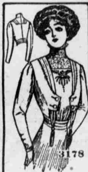
3178—Ladies' Waist, with girde and body lining. A pretty model for messaline, chiffon or crepe de chine. Five sizes—34 to 42.