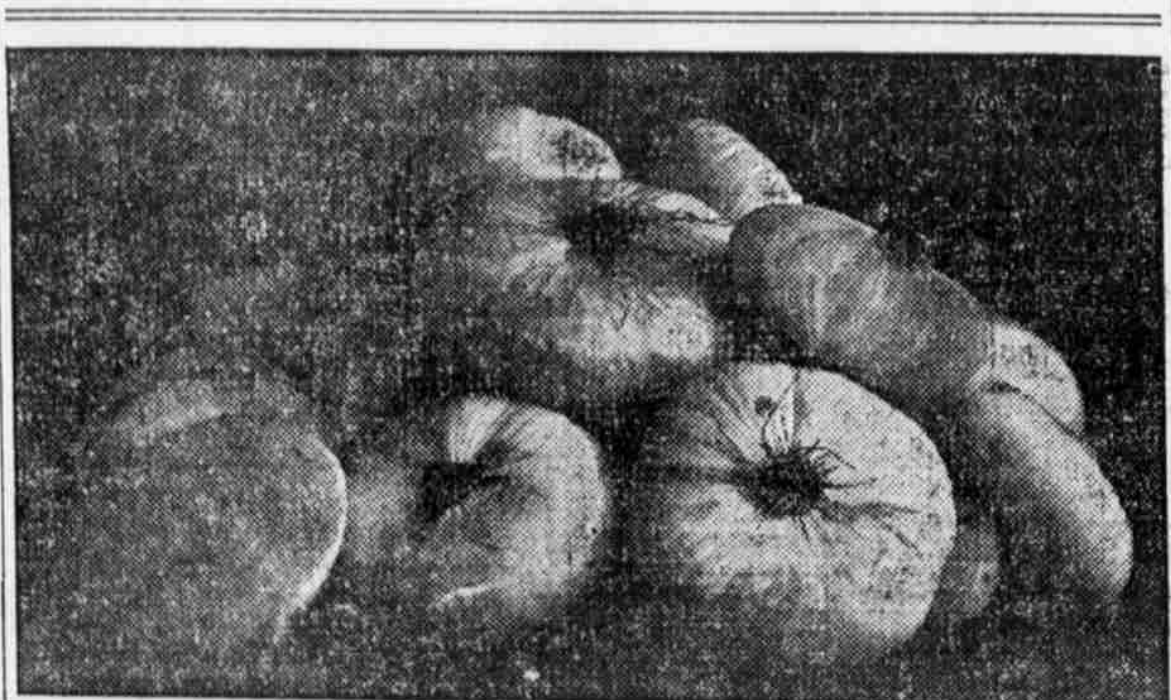
CRYSTAL WHITE WAX ONIONS AT SAN BENITO

We do not wish to claim or promise that all can do this well. A great deal depends upon the "know how." We have all the natural conditions necessary and are able to market our products at a time when they command the TOP PRICE. The rest is up to the grower himself.