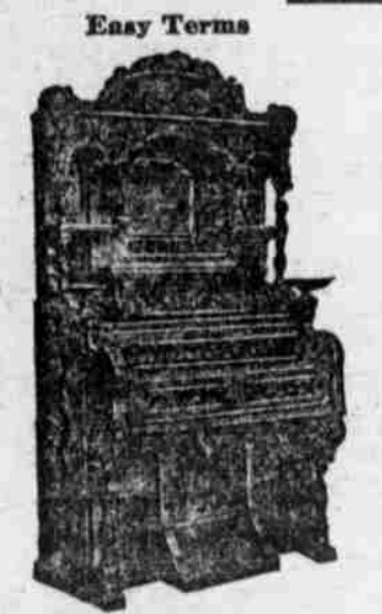
We Give You a Legal Bond of Indemnity

ment for 25 years Buy On The Cornish Plan-Save OneThird against defect in mater--Save OneThird ial or workmanship.