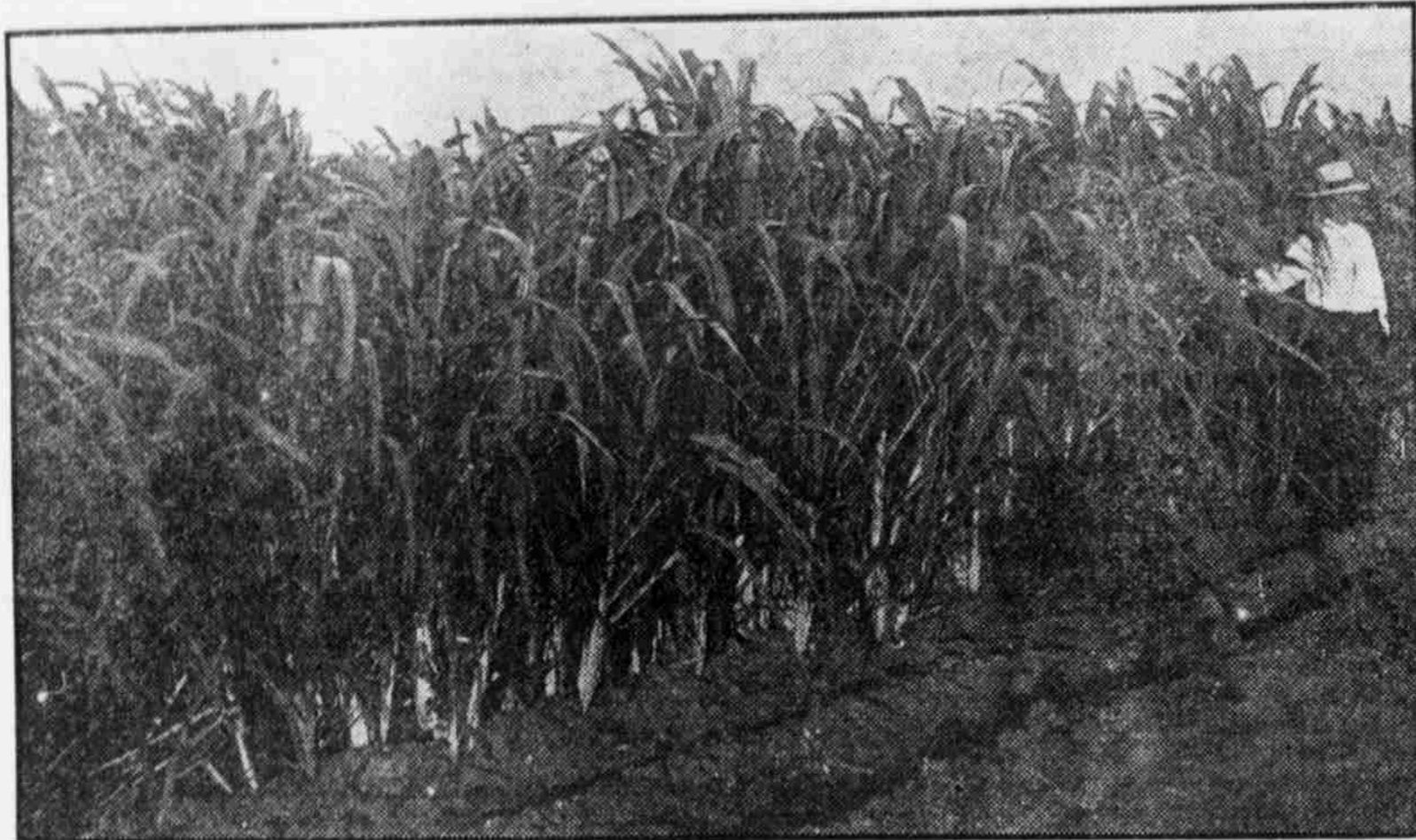
A Four Months Old Sugar Cane Field at San Benito

Best Sugar Cane Soil in America — Delta of the Rio Grande