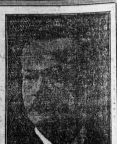
WILFRED THOMASON GRENFELL Explorer, Author and Contributor