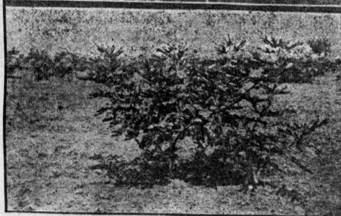
Oranges, Strawberries and Figs of the Gulf Coast Country

the Rio Grande that fertilizes the soil with every irrigation, and with an abundance of capable farm labor at lower wages than anywhere else in the United States, the La Lomita Lands bid fair to outrival California and Florida, in the variety and quality of her products. In truck growing it produces earlier vegetables and fruits than any other part of the United States, shipping to northern markets in January when prices are highest.