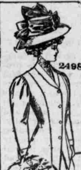
2498—Ladies' Coat in 27-inch Length known as the "Clarice Vance." An excellent model for any of the season's new coatings. Seven sizes—32 to 44.