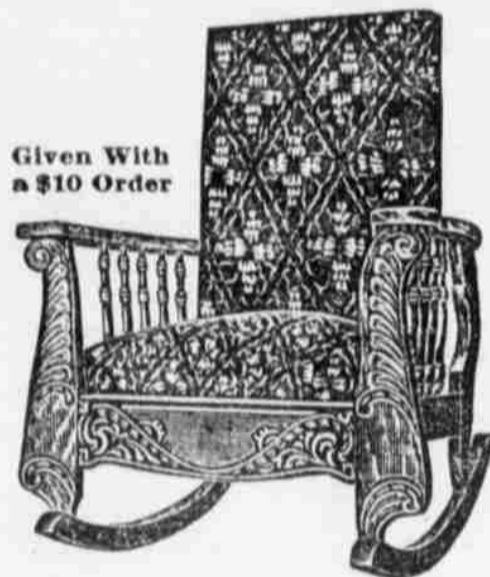
Given With a $10 Order

Y OU will admit that buying home needs such as soaps, baking powder, teas, coffees, etc., from the store-keeper is very expensive. Every day you feel the burden of excessive high prices. Well there's a reason—you are paying too many middlemen's profits. Why not stop it—there's a better way.