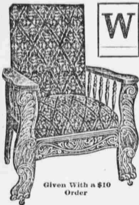
Given With a $10 Order

W E want to explain to the readers of this paper our plan whereby we are furnishing thousands of homes every year, with beautiful and useful articles, like these illustrated in this advertisement, without cost , to our customers.