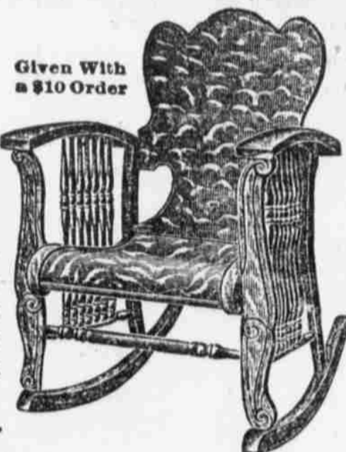
Given With a $10 Order

in the saved middlemen's profits this way of buying affords. Furnish your home throughout without cost . Thousands are doing it. Why not you?