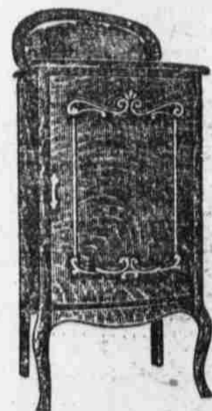
Given with $10 Order