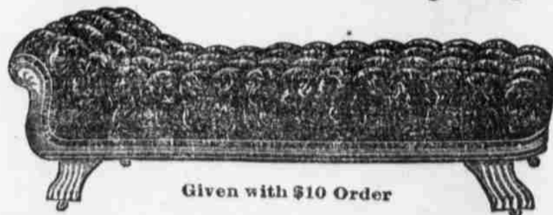
Given with $10 Order