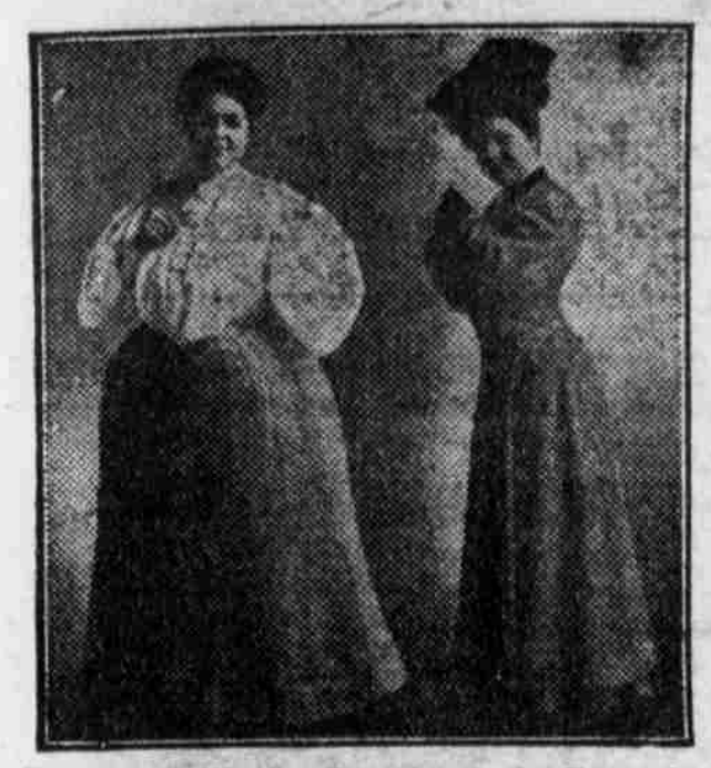
The above Illustration shows the Remarks ble effects of this wonderful Obesity Food--What it has done for Others it will do for you

My new Obesity Food, taken at mealtime compels perfect assimilation of the food and sends the food nutriment where it belongs. It requires no starvation process. You can eat all you want. It makes muscle, bone, sinew, nerve and brain tissue out of the excess fat, and quickly reduces your weight to normal. It takes off the big stomach and relieves the compressed condition and enables the heart to act freely and the lungs to expand naturally and the kidneys and liver to perform their functions in a natural manner. You will feel better the first day you try this wonderful home food, Fill out coupon herewith and mail to-day.