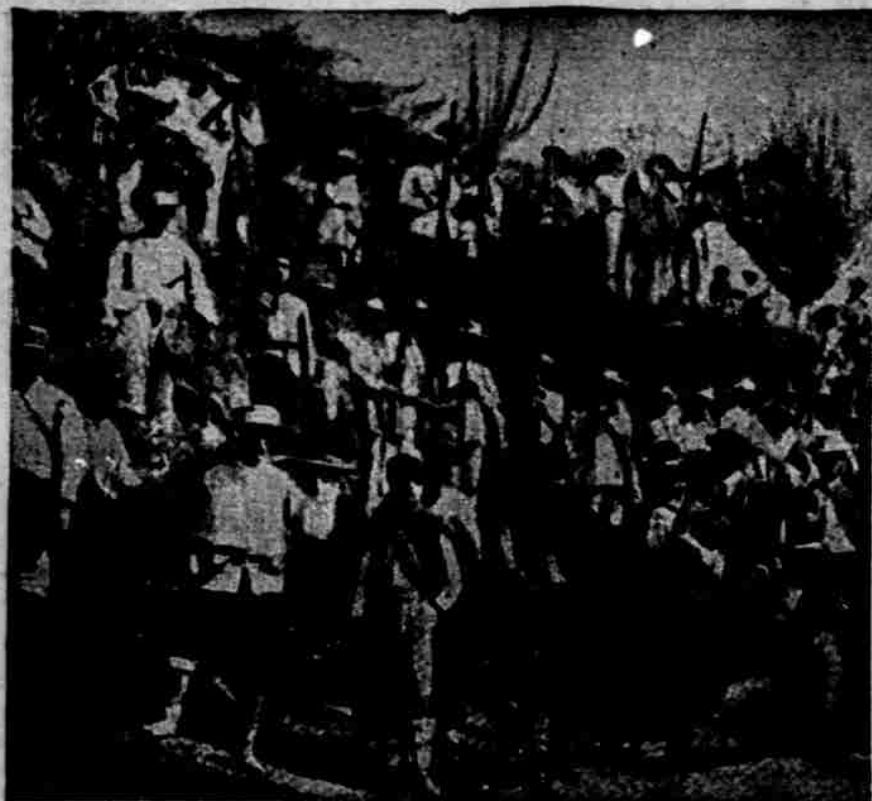
SQUAD OF VENEZUELAN REBELS.

General Matos, leader of the revolutionary forces in Venezuela, declares that he has an army of twelve thousand men ready to depose Castro. The Venezuelan president must therefore turn from danger without to quell insurrectionary strife.