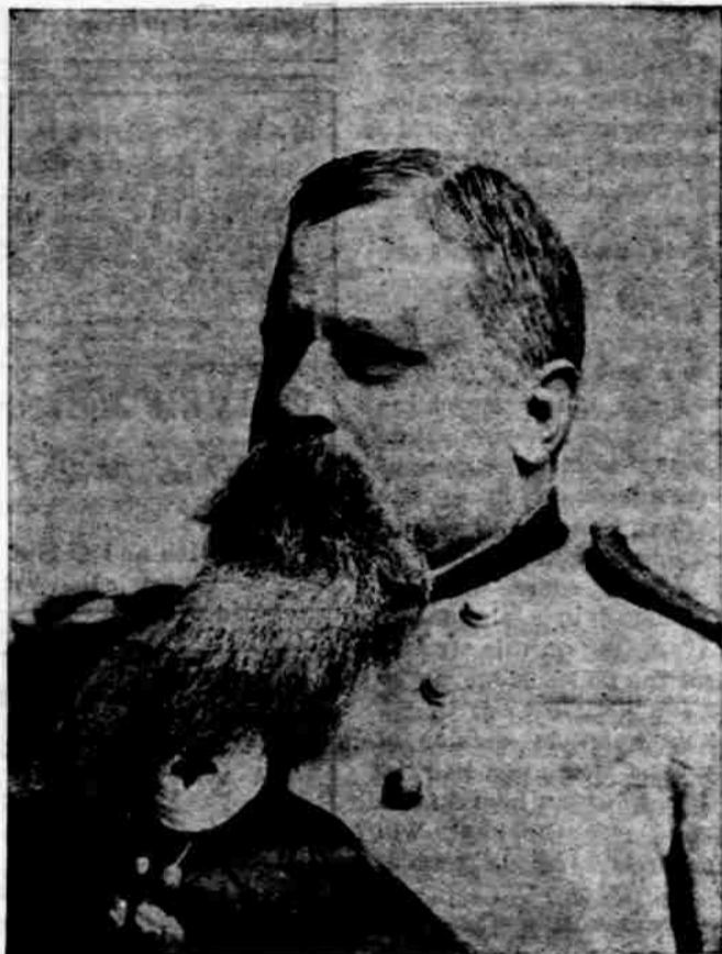
GENERAL FITZHUGH LEE, Whose lecture will constitute the opening attraction of the Epworth Assembly.

List of Attractions of Unusual Variety, Assuring a Treat for All Who Pitch Their Tents—Fitzhugh Lee to Come on Opening Day—August 6th to 14th Dates of the Assembly