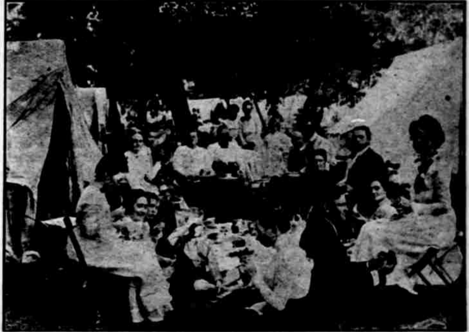
Camp Life at the Assembly.

give chalk talks during three of the nine assembly days.