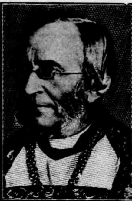
His Reverence, the dean of Westminster, takes a very important part in the religious coronation service. It is his duty to handle the crown, which he delivers to the archbishop of Canterbury, who places it on the head of the king.