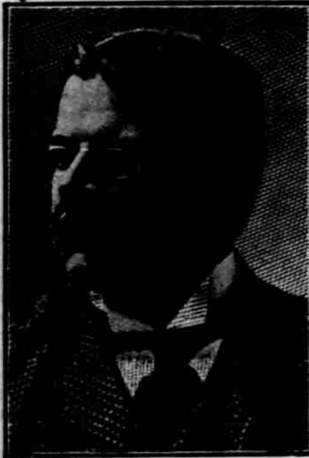
Edwin Austin Abbey, R. A., has received the royal commission to paint the official picture of the coronation. Mr. Abbey being an American, born and bred, this great distinction conferred upon him is of unusual interest to the people of this country.