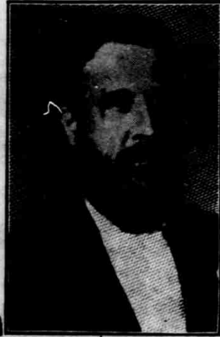
Lord Cavendish, duke of Devonshire, will be an important figure at the coronation. His Grace is one of the most prominent and distinguished members of the British peerage and his work on educational, religious and political lines has earned him a wide international reputation.