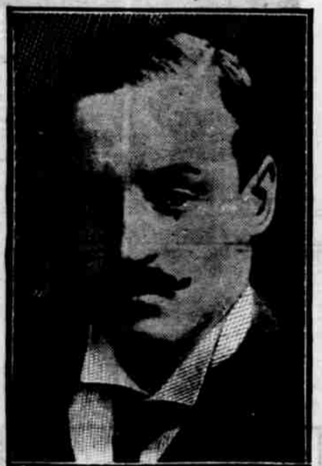
The duke of Marlborough will be one of the chief of the peers who will participate in the coronation service. This is his latest picture.