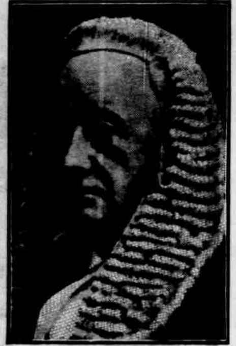
The oath of office will be administered to King Edward by the lord chief justice of England, Lord Alverstone, better known, perhaps, as Sir Richard Webster. Here is his very latest photograph.