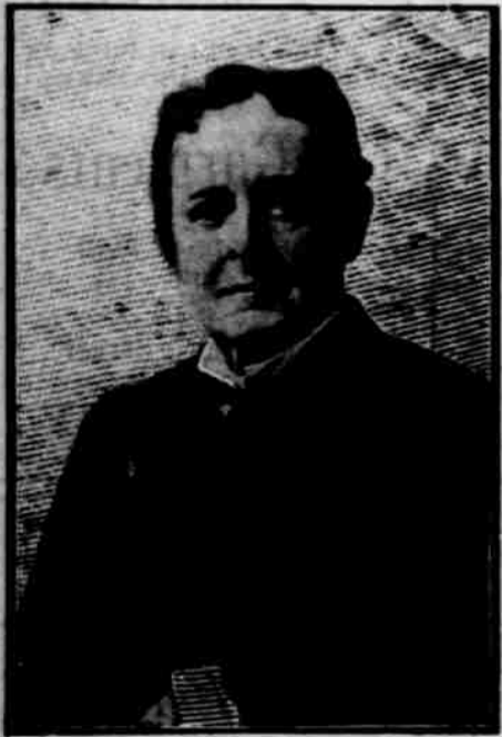
King Edward's evident desire to show favor to Joseph H. Choate, United States ambassador to England, as exemplified by the recent extraordinary honor the king conferred upon him by partaking of his hospitality, makes the American minister the most talked of foreign representative in London, and his presence at the coronation will make something of a stir.