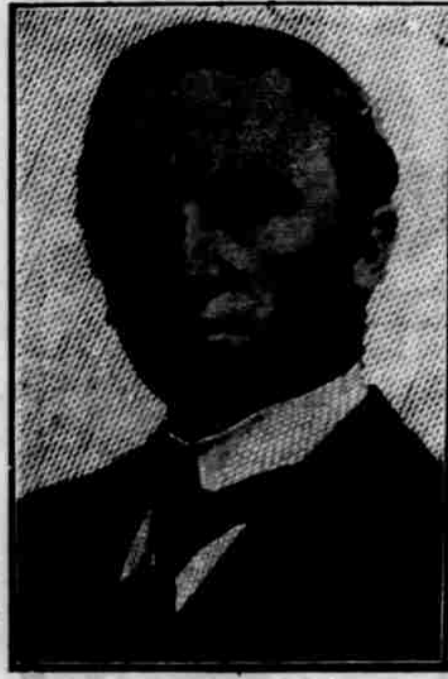
Lord Curzon, governor general of India, will be one of the most important of the colonial rulers who will be present at the coronation. He will also participate prominently in the big convention of colonial leaders which will be, perhaps, historically of more importance than the procession itself.