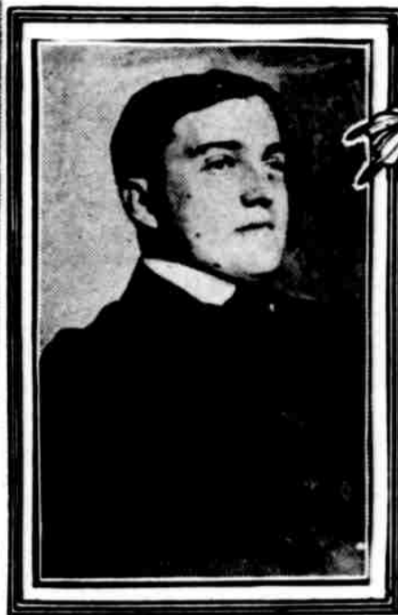
DUKE OF MANCHESTER