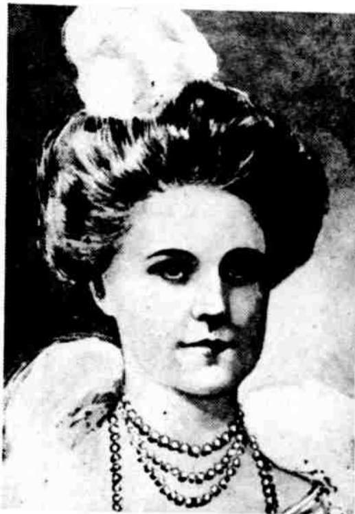
DUCHESS OF MANCHESTER