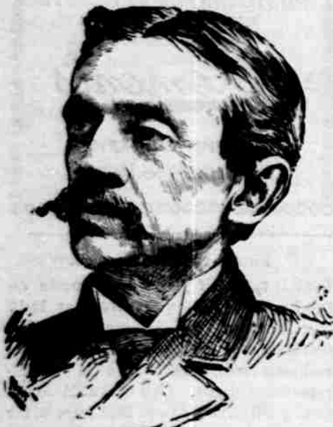
FRANK R. STOCKTON.

Mr. Frank R. Stockton's new serial, which will run in Harper's Weekly during the summer months, has been entitled "The Associate Hermits." It is a story of vacation life in the Adirondack woods, and in this subject Mr. Stockton has found an excellent opportunity of