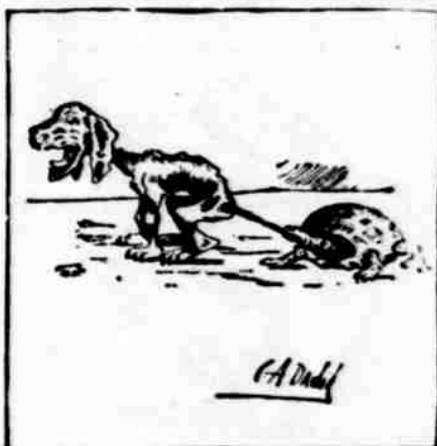
The biter bit.

THE HAWKS NURSERY COMPANY Milwaukee, Wis.