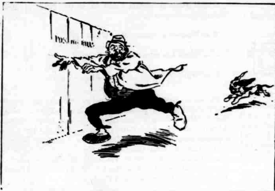
1—"Great Scott! I hope I'll reach that fence before he nips me."