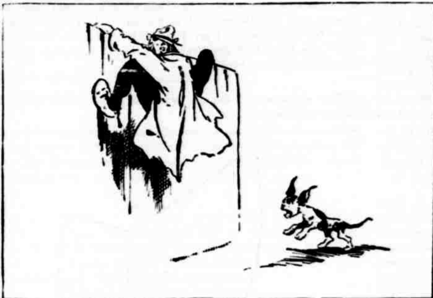
2—"Well, thank my lucky star—but—"