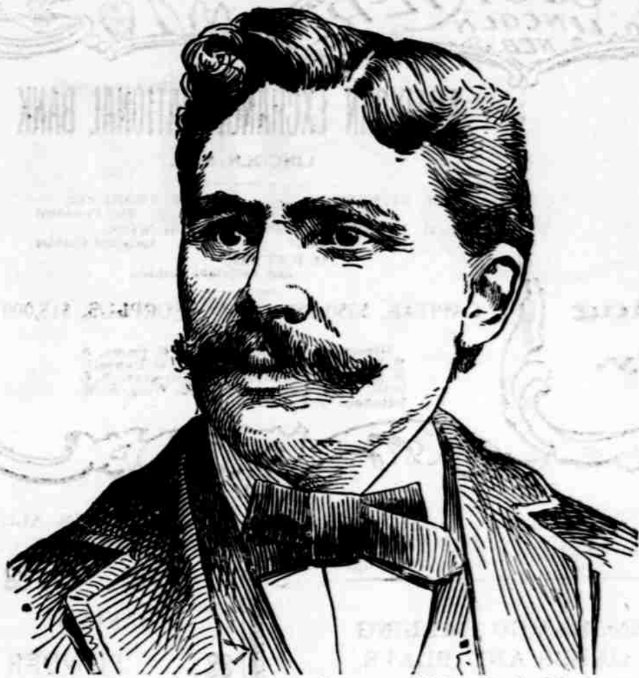
SAVANNAH, N. Y., March 18th, 1894.