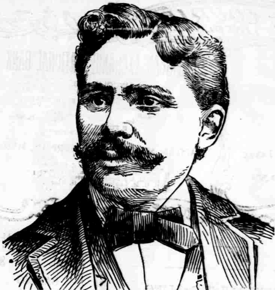
SAVANNAH, N. Y., March 18th, 1894.