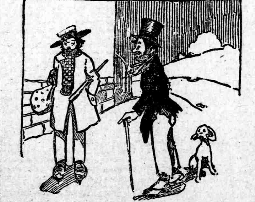
Algy—Hallo! What has become of the tail of your coat? Gussie—Gone to the dogs, con rade!