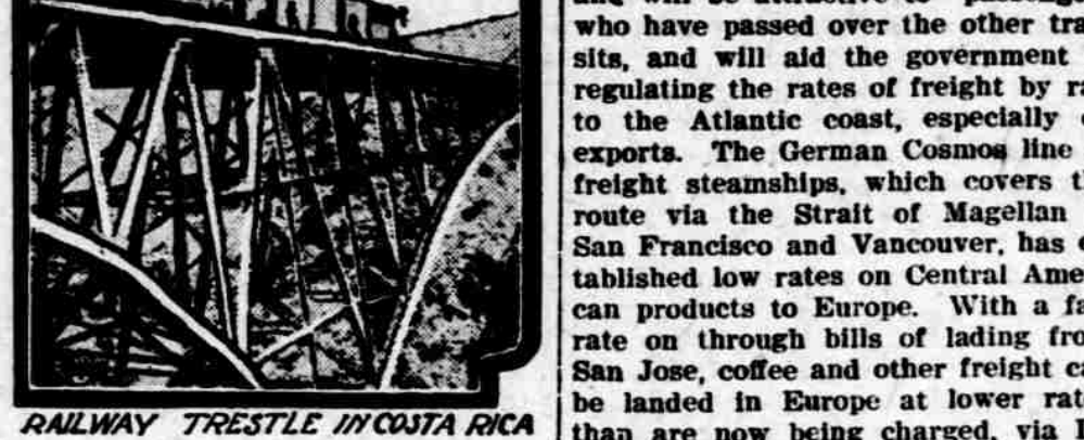
RAILWAY TRESTLE IN COSTA RICA