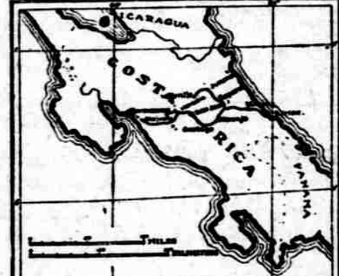
Map of Costa Rica Showing Route of Railroad.

Already the healthy and invigorating climate of the Costa Rica tablelands is attracting many visitors from the Panama canal zone, hotel accommodations at Cartago and San Jose being now inadequate.