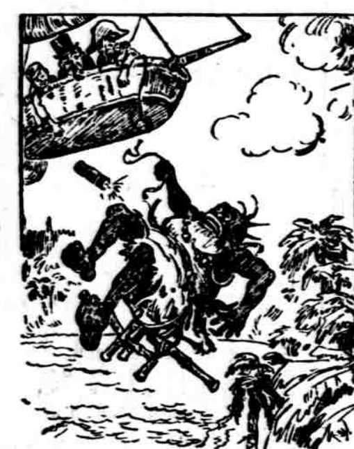
"Take That from Your Little Hen-

Pa stood around trying to look like a saint, and he pointed to the sun, just rising over the hills, and got on his