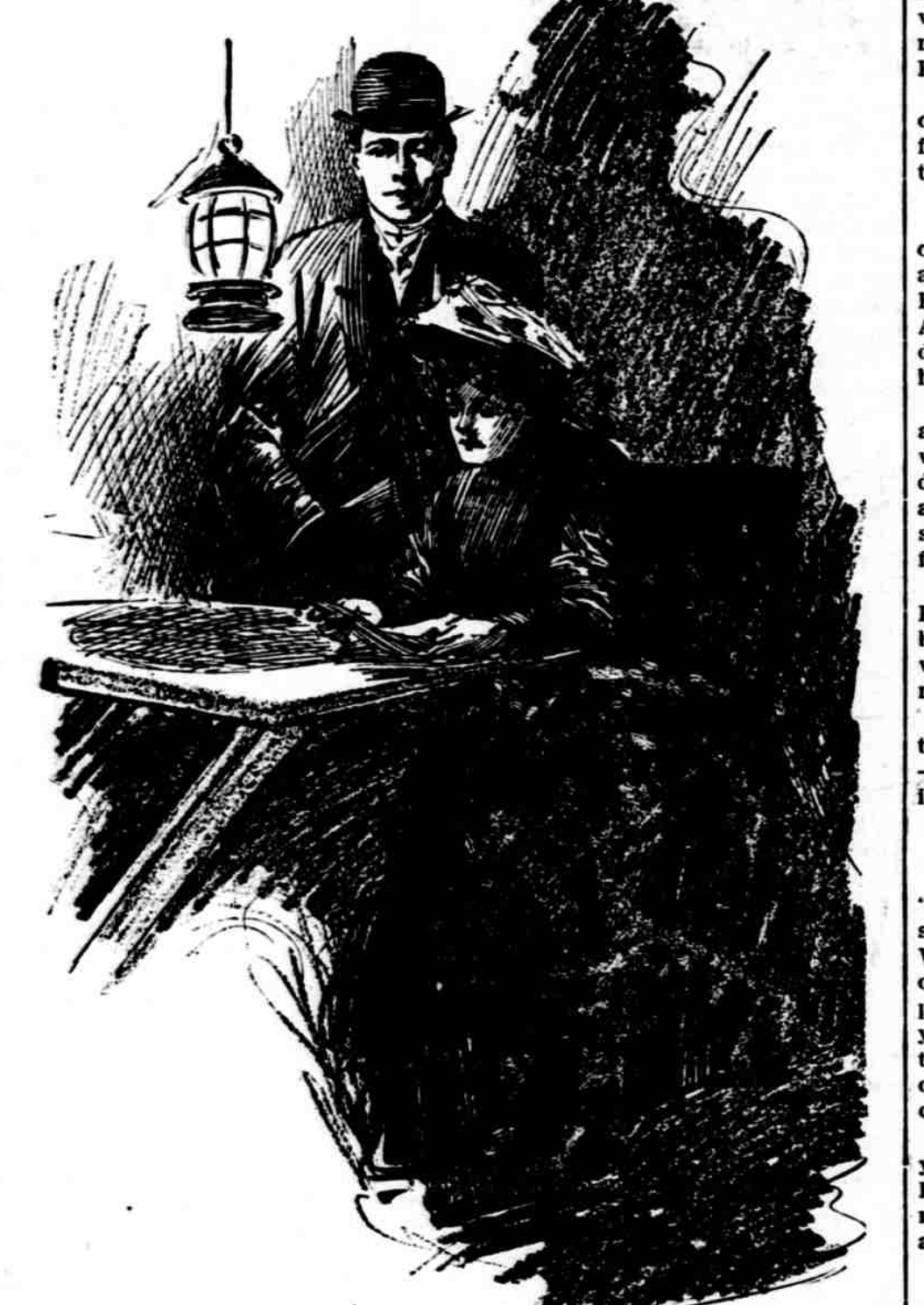
"IT IS THE SAME," SHE SAID, AT LAST, "IN PART, AT LEAST."

"That is what mother used to say to me many times when I was a child. If I was going upstairs, I must look about me and see if there was 'some thing downstairs that belonged upstairs that I could carry up and put into its place; and so on from one part of the house to another."