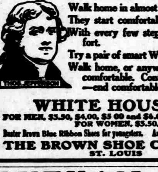
THE BROWN SHOE CO., MAKERS ST. LOUIS