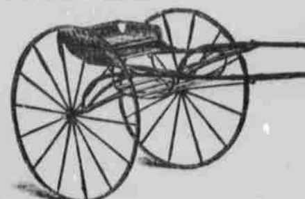
OUR No. 1 ROAD CART.

Our work is fully warranted, is of excellent material and finish, and moderate in price. Our line of Buggies is very complete. We make a specialty of Hand and Machine Made Harness. Write for prices. Address,