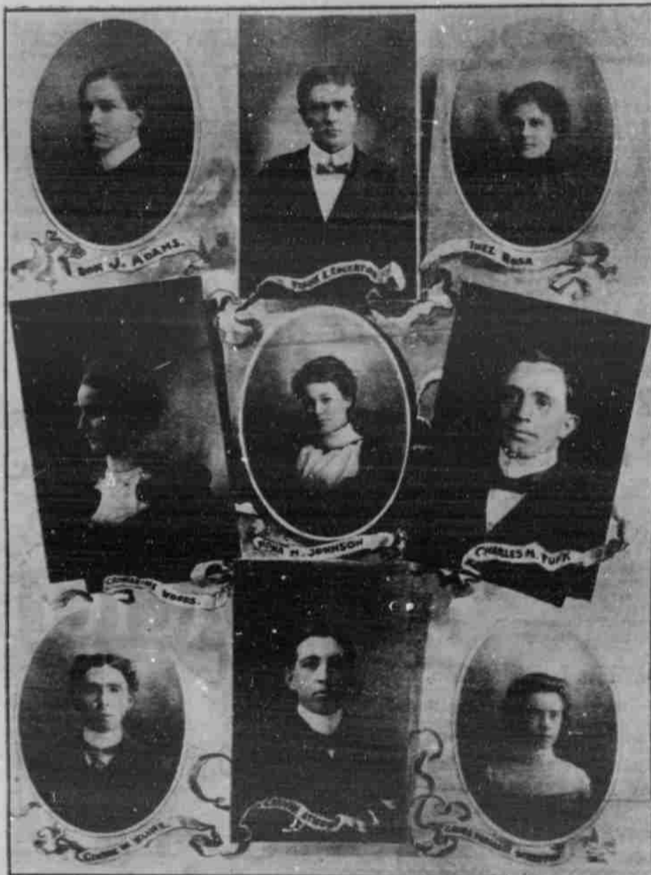
BOARD OF EDITORS OF SENIOR CLASS BOOK