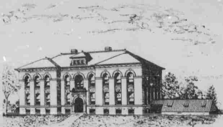
NEW EXPERIMENT STATION BUILDING.

The first floor is devoted to the offices and laboratories of the experiment station. This is the institution supported by the government, which is working out the problems of the farmer and making it possible to teach agriculture in a practical way. The scientist is here brought directly in contact with practical farm operations and tests all theories before advocating them. The