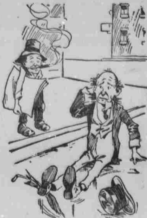
Mr. Ugglimogge—What do you mean by laughing at me when I've fallen down? Chimmie (apologetically)—Dat's all right, boss. I'd have laughed anyhow. —New York Journal.

At last he left his native place and to the city went; The townsfolk wept, but on his face there shone a sage content. "I shall be truly great some day," he said within his heart; "My voice shall never, never play a measly second part!" See how the kindly fates advance a man of pluck and brains— He has a railway station job as "caller" of the trains!—Ex.