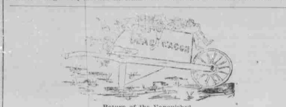
Return of the Vanquished.