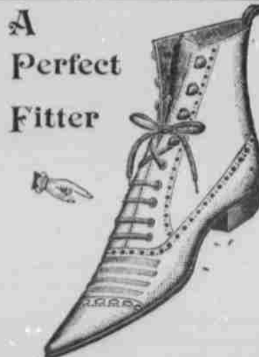
A Perfect Fitter