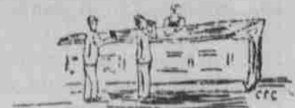
SETTING UP EXERCISES