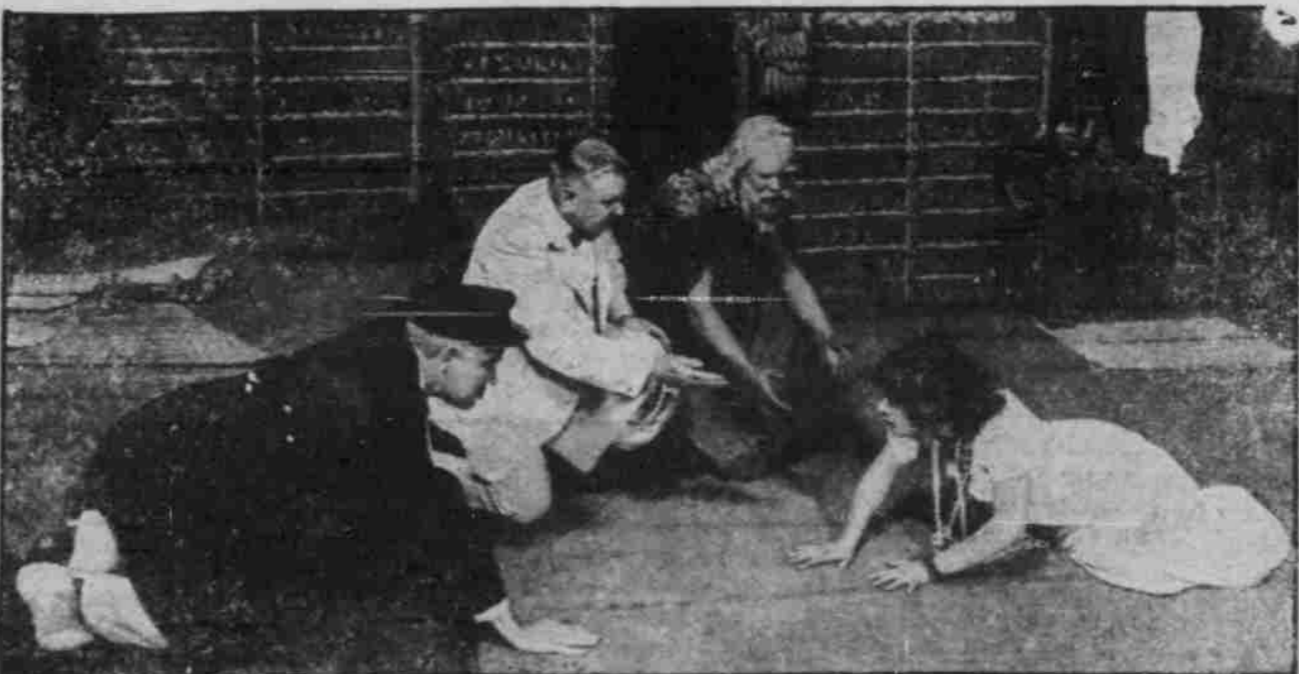
Scene from "THE BIRD OF PARADISE," at the Oliver Theatre

Congress will be asked to appropriate about $4,500,000 for the reserve officers' training corps at the coming session. The war department estimates that during the coming year there will be in the reserve officers' training corps about 50,000 students, and officers will have to be provided for them. Of the sum appropriated, uniforms, equipment, tentage and transportation will require almost two and a half million. Besides universities, the high schools of thirty-five cities have applied for governmental aid under the provisions of this act. Nebraska University will be given a branch.