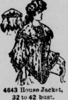
4643 House Jacket, 32 to 42 bust.

House Jacket. House jackets are possessions of which no woman ever yet had too great a variety. This one is made with a slightly open neck and loose sleeves that are much to be desired from the standpoint of comfort as well as beauty. The model is made of flowered challie trimmed with lace, but is well adapted to all the prettiest washable fabrics in vogue. The big collar is a feature and gives the long, drooping shoulder line which so completely marks the season.