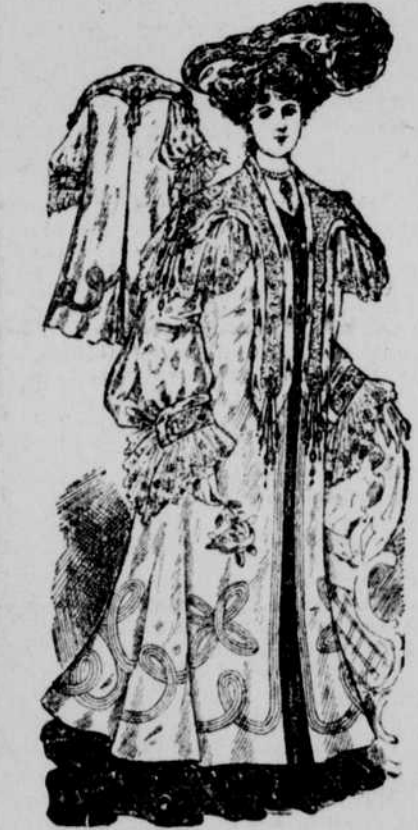
4623 Evening Coat, 32 to 40 bust.

The quantity of material required for the medium size is 101/4 yards 21 inches wide, 5 yards 44 inches wide, or 414 yards 52 inches wide, with 214