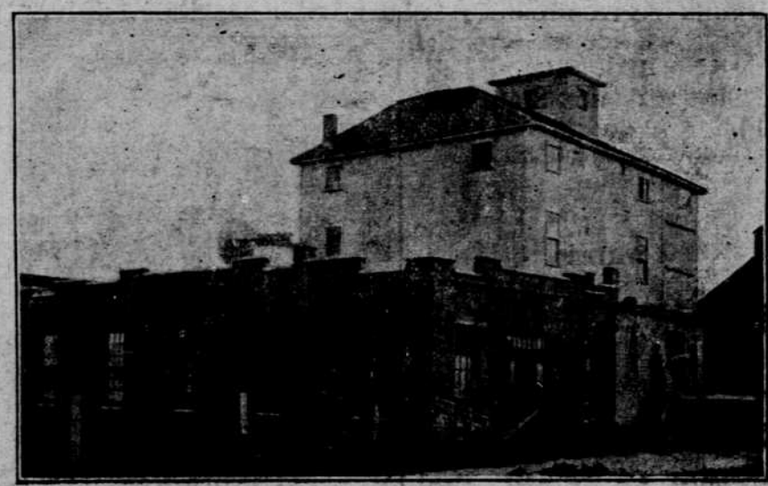
Mill and Electric Light Plant, Loup City, Nebraska

about 1600 population, and it has only started to grow. It enjoys excellent railroad facilities, being reached by both the Burlington and Union Pacific lines. Within the next few years, when the surrounding country shall have come into its own and its real merit realized, it is safe to anticipate that Loup City, which must serve as a financial, business and distributing point for this territory, will greatly increase in population, wealth and general prosperity.